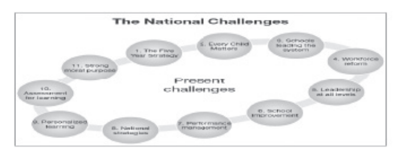
Fig. (2): Change and Progress Swainston (2008 p.7) [19]

It is worth of note that the pedagogical outcomes and the scholastic test provide the educators with sufficient scholastic database concerning learners' background knowledge (schemata) as well as their ongoing educational development in micro and macro skills for instance.